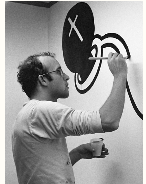
Haring, 1986 at the Stedelijk Museum, Amsterdam Photograph: Nationaal Archief

Haring, 1984, Photograph: Stuart William Macgladrie/Fairfax Media via Getty Images